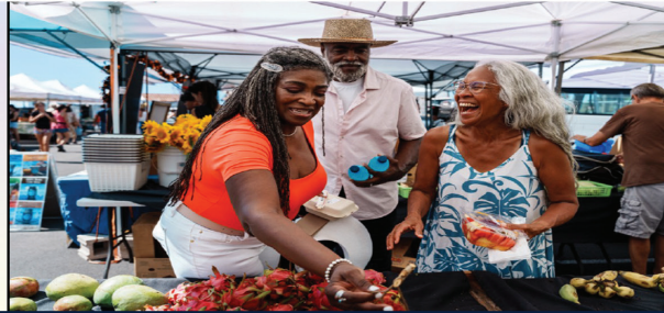
Charleston & Savannah • Charms of the Southeast April 21-27, 2026