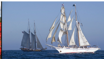
Coastal Maine Fall Foliage October 6-12, 2026