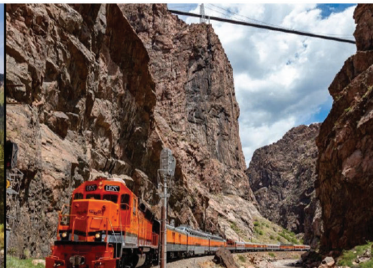
Colorado Rails & Rockies June 1-8, 2026