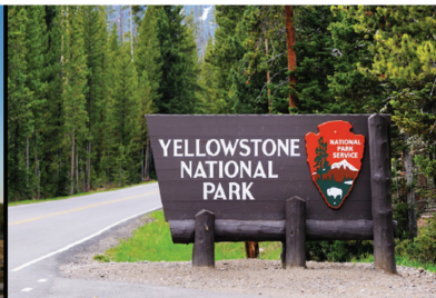
Yellowstone & The Grand Tetons August 21-27, 2026